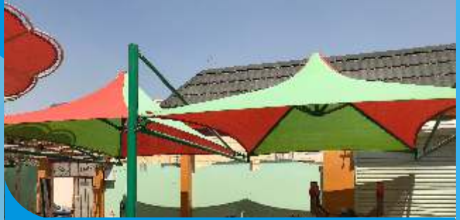
Sun Shade at Grandma Nursery