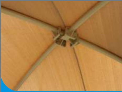
Car Parking Shade Top Section