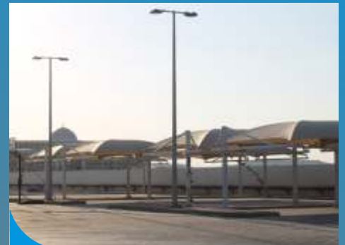
Car Parking Shade at Coca Cola Plant