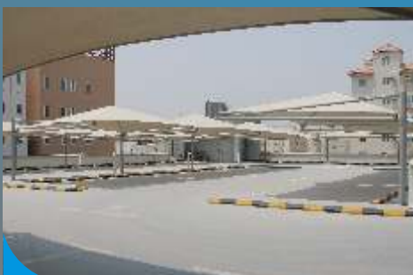
Car Parking Shade at QP Building