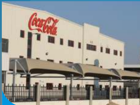
Car Parking Shade at Coca Cola Plant