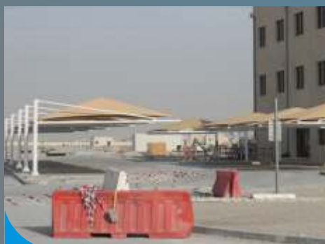
Car Parking Shade at Qatar Gabbro Terminal