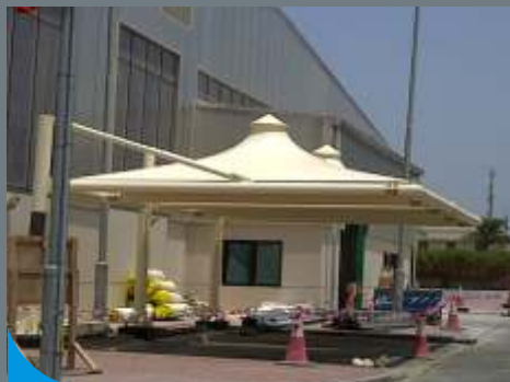
Conical Shade Fabric Ferrari PVDF Fabric at QP