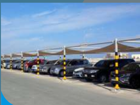
Car Parking Shade at Dolphin Energy- Ras Laffan