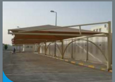
Pyramid Shape Car Parking Shade Fabric : HDPE –Comshade