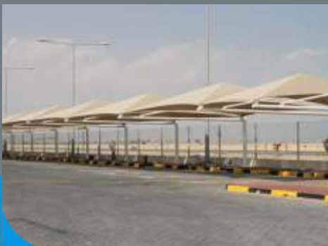
Car Parking Shade at GWC Rass Laffan