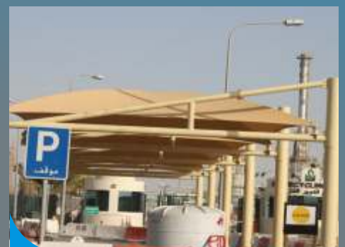
Car Parking Shade at QP Dhukkan