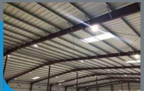
Warehouse Inside View