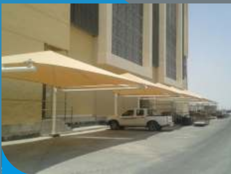
Car Parking Shade HDPE Fabric –Gale Pacific