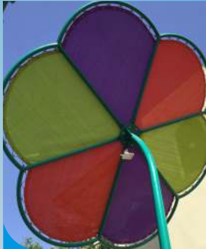
Flower Shade at Grandma Nursery