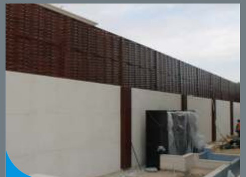
Boundary Wooden Fence