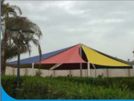
Sail Shape Play Ground Shade