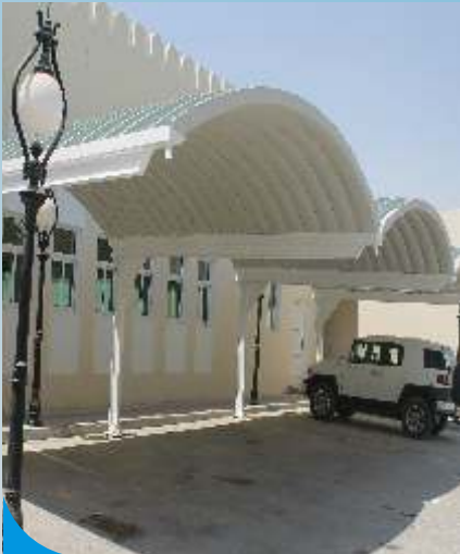
Kwick Span Shade at Shahania Palace