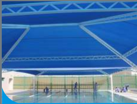
Swimming Pool Shade at Doha College