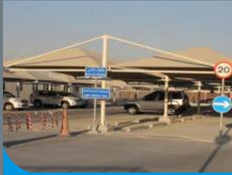
Car Parking Shade at Qatar Foundation