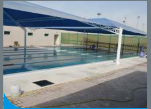
Swimming Pool Shade at Doha College