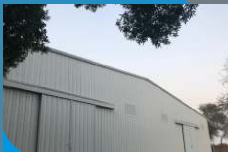
Warehouse at Shahania Palace