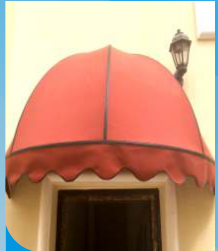
Canopy At al Qissa Villa Compound