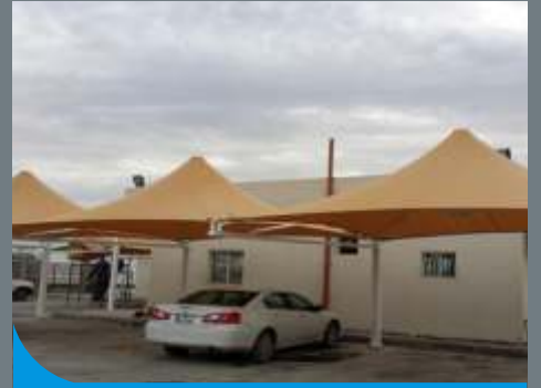
Car Parking Shade at UCC Camp in Shahania