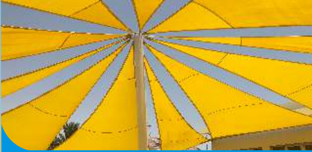
Sail Shade at Garafa Nursery