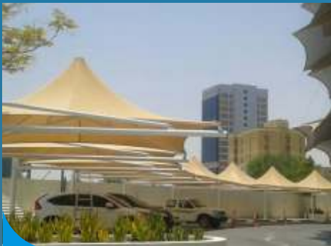
Car Parking Shade a Sheik Ghanem Business Center